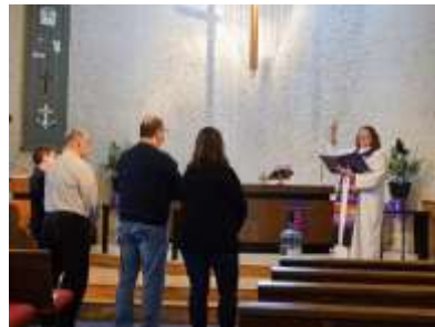
Installation of Council

Council is asking members to complete a survey for ideas and suggestions on the direction that Grace should be going. Paper copies of the survey are available in the narthex or can be completed online using the link: https://www.surveymonkey.com/r/Q68RM3R